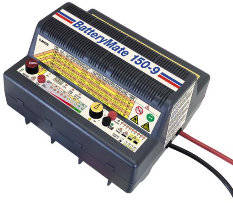
De-sulfating Charger

Complex battery chargers are available that can apply a de-sulfating voltage cycle to the battery. These chargers are expensive and usually only purchased by dealerships. It takes a higher than normal voltage to break down the sulfate and re-combine the sulfur ions back into the electrolyte as acid. When the process begins to work, as evidenced by increased current flow, the charger gradually backs the voltage down to a normal level. Chargers are purpose-built to perform the de-sulfating process and they work very well. No amateur should attempt any homemade process to de-sulfate a battery because of the risk of explosion. Battery acid will permanently damage eyes and breathing passages.